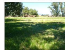
Wallowa-McDaniel II Restoration Project: July-August 2007 Construction Sequence at Station 6+00 (Meander Pool, Left Bank viewing downstream)