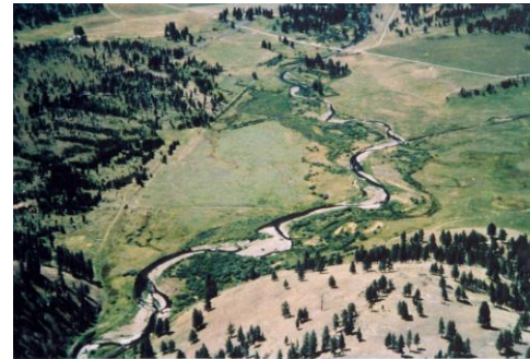
Meadow Creek (McCoy Meadows Restoration Project, 07 aerial photo)