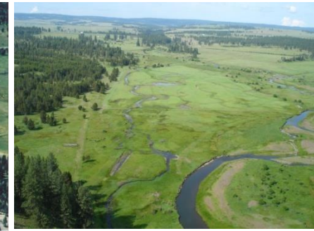
Meadow Creek project in 09 illustrating floodplain connectivity and vegetation response